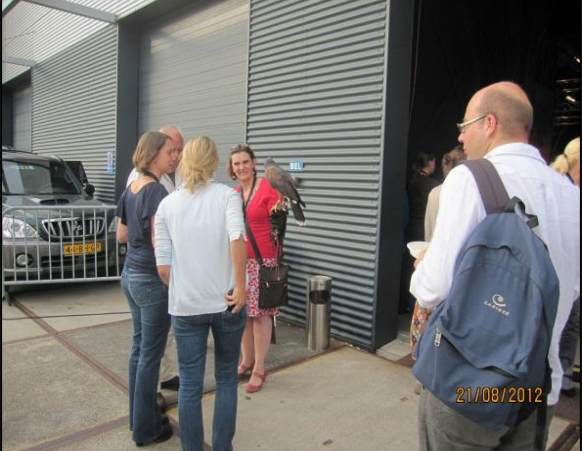
BBQ and knowledge exchange at the forensic archaeology sub group meeting

For more information visit the EAFS 2012 website; www.eafs2012.eu