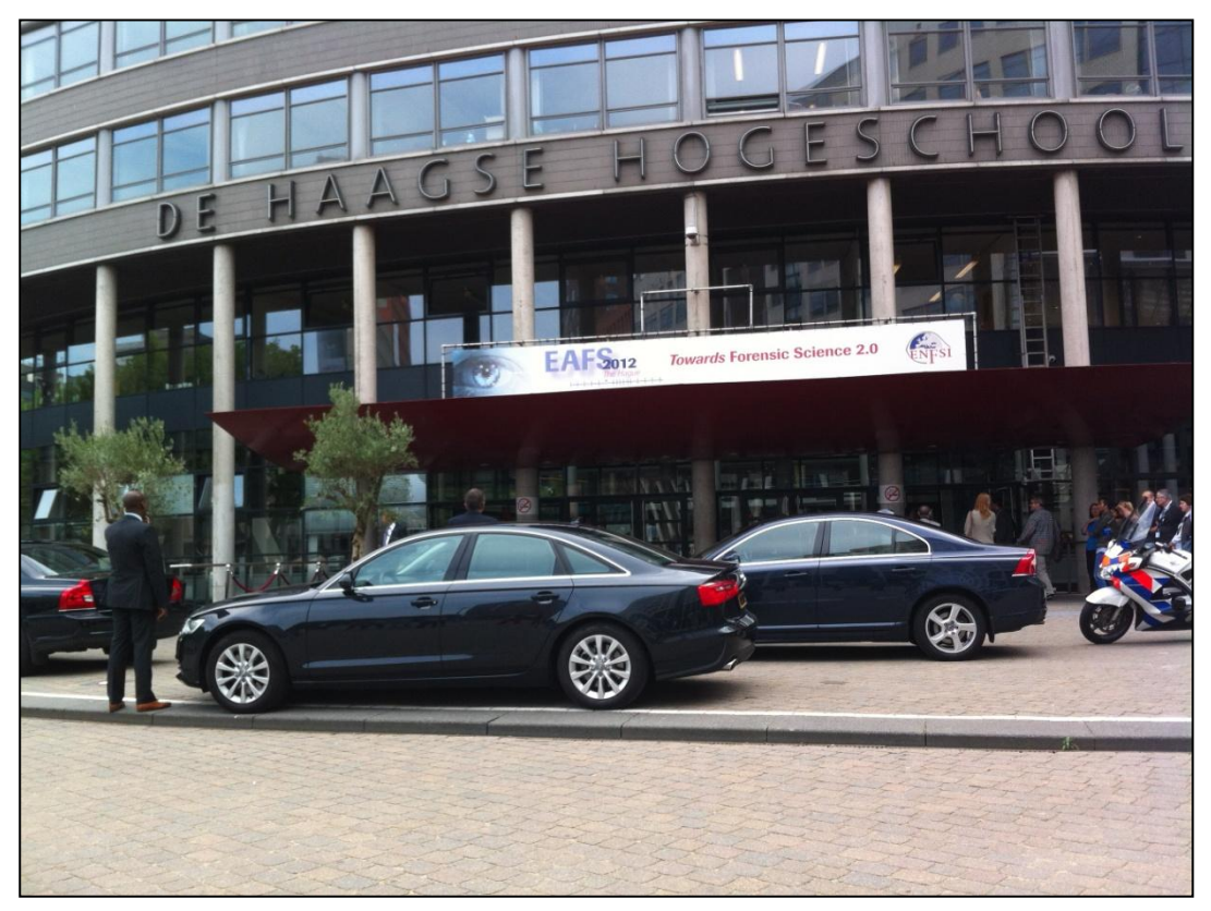
Waiting for Princess Beatrix to arrive on the final day of the conference.