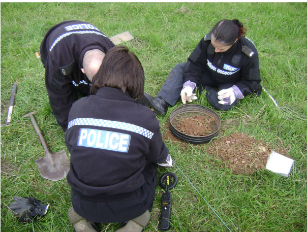
Figure 10. Forensic geology operational support for a ground search.

eral Centre of Forensic Science, Ministry of Justice, Moscow, Russia;