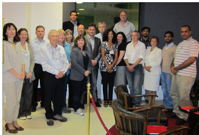
Figure 2. IUGS-IFG Committee Inaugural meeting in Rome, 19 th September 2011.