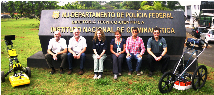
Figure 6. IUGS-IFG & Brazilian Federal Police forensic geology workshop and training, Brasilia, Brazil, October 2013 and December 2015.