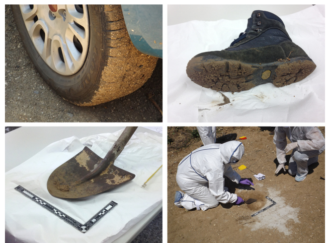
Figure 1. Soil, adhered onto various items and its forensic recovery (Photos: Laurance Donnelly and University of Messina, Sicily, Italy).

Forensic geologists have also been involved in fake and fraud cases. Such as the Bre-X group of companies in Canada who reported that an enormous gold deposit has been discovered at Busang, Indonesia. Mineralogical analysis showed that different gold from another locality had been illegally and artificially introduced into samples to inflate the value of the assets. This discovery caused the collapse of Bre-X shares and revealed the biggest mining scam in history. Other fakes and fraud include rare fossils, diamond and precious gemstones, rare earth metals, metal theft, and the mineralogical analysis of paint to reveal art fraud (Fig. 1).