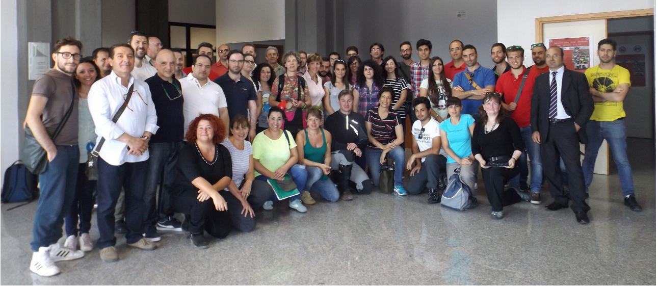
Figure 9. IUGS-IFG with staff and delegates from the MSc in Forensic Geology, University of Messina, Sicily, Italy.