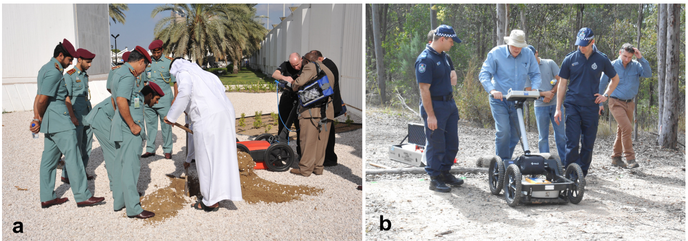
Figure 8. IUGS-IFG knowledge transfer & training with the Abu Dhabi Police (a) and Australian Federal Police (b).