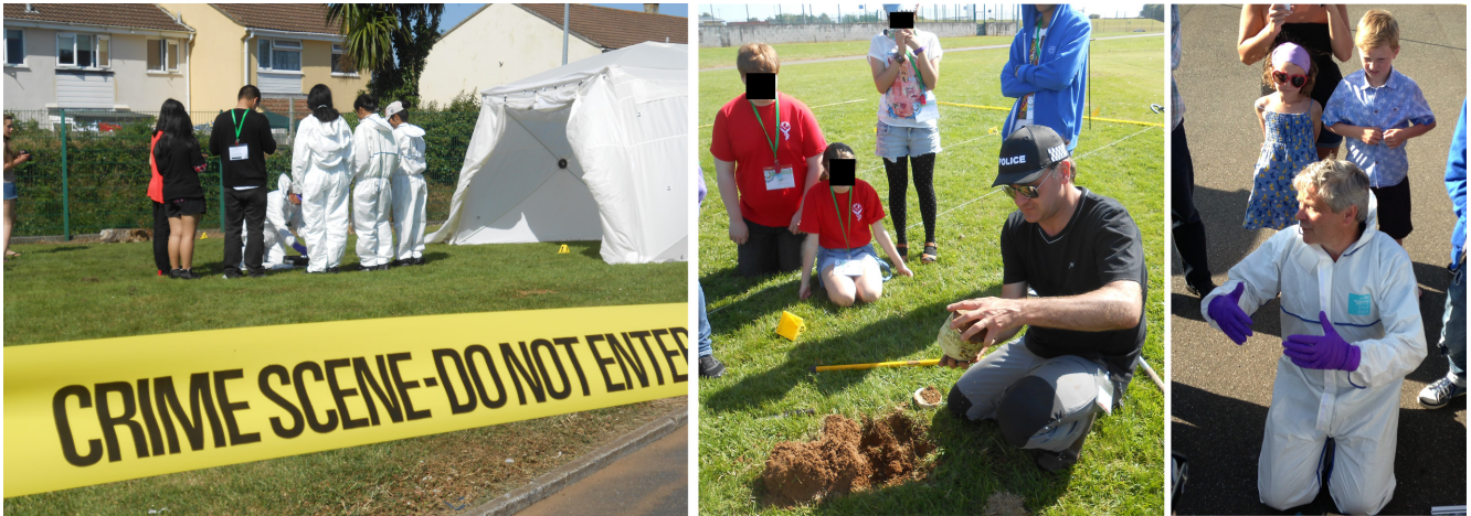
Figure 4. Students undergoing training in search and the collection of geological trace.