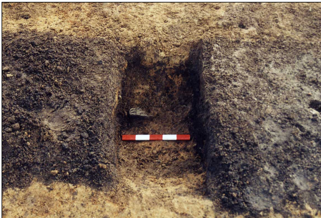
Plate Two: Section taken through C. 102 and C. 103 looking south.