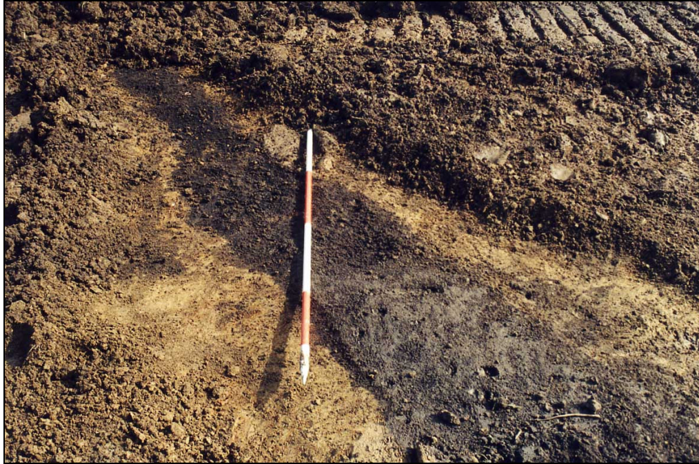
Plate One: C. 102 and C. 103 looking east.