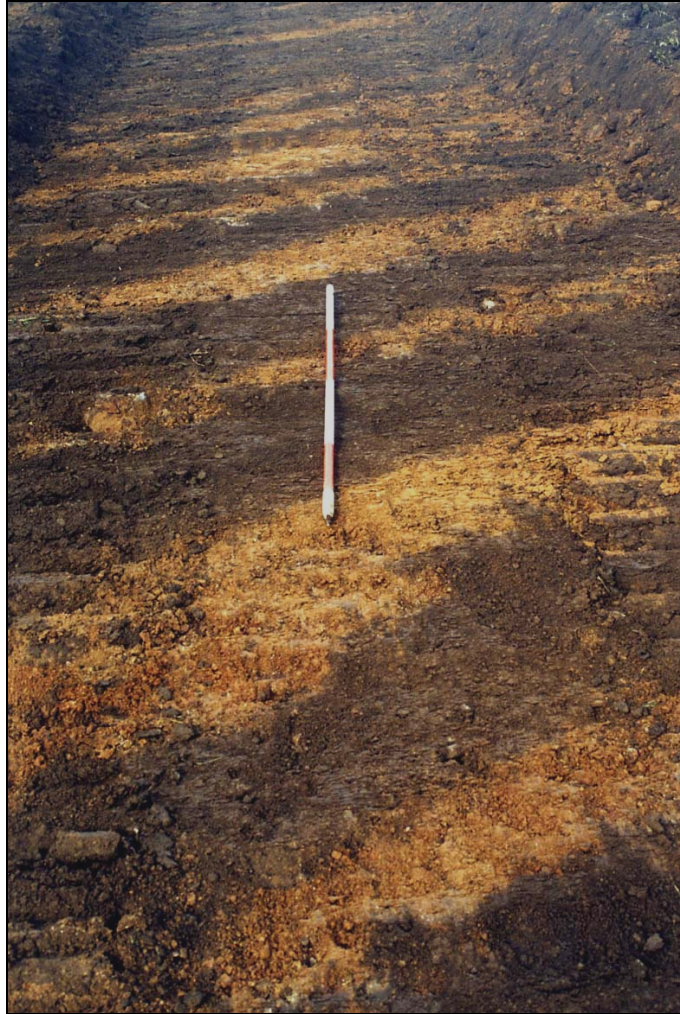
Plate Five: Ridge and furrow agricultural features.