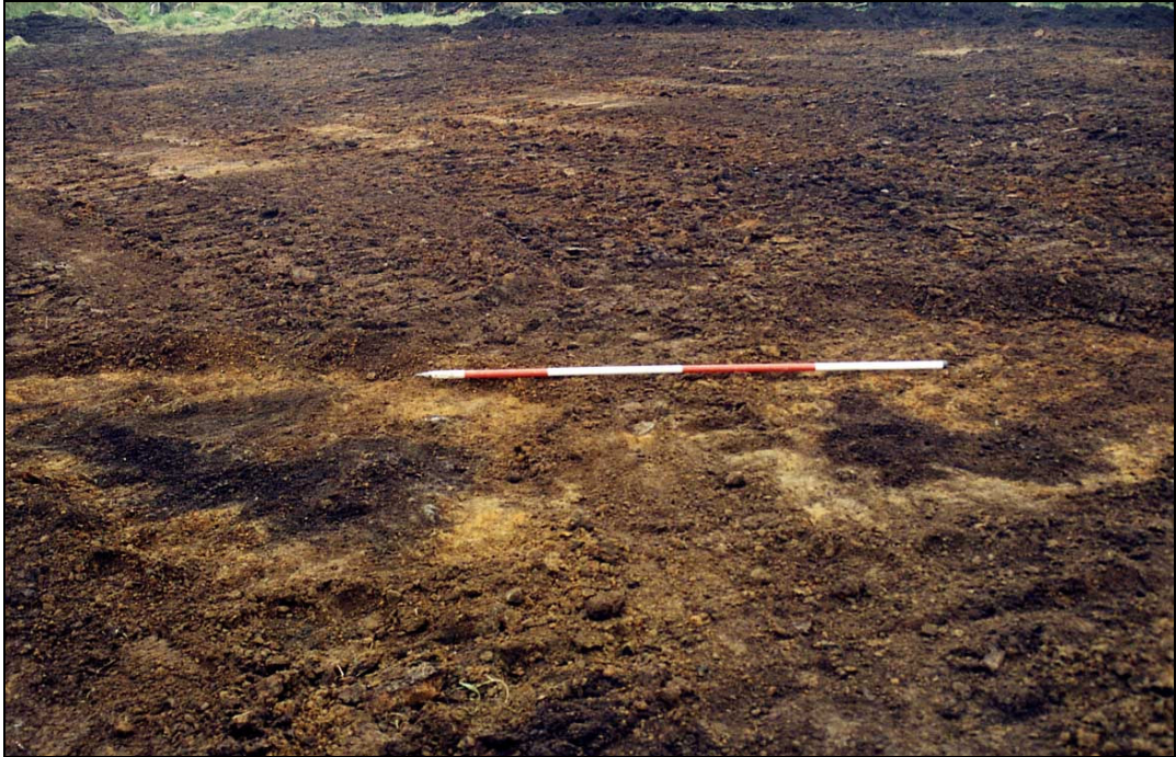
Plate Three: C. 104 / 105 / 106 / 107.