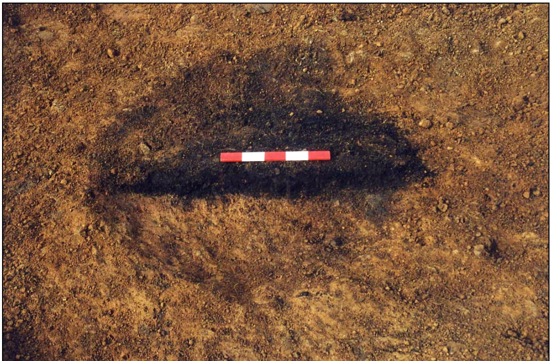
Plate Four: Circular hearth (C. 109 and C. 110).